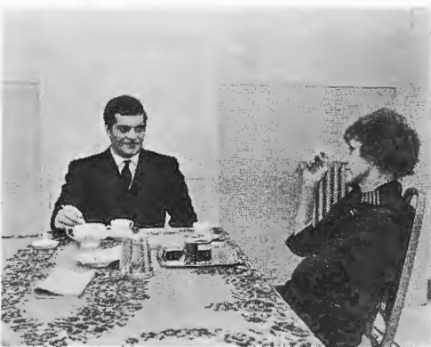
Top: Vivien Leigh, Warren Beatty, and Lotte Lenya in the Warner Bros. film version of Tennessee Williams' "The Roman Spring of Mrs. Stone," in which Lenya played a wily procuress.