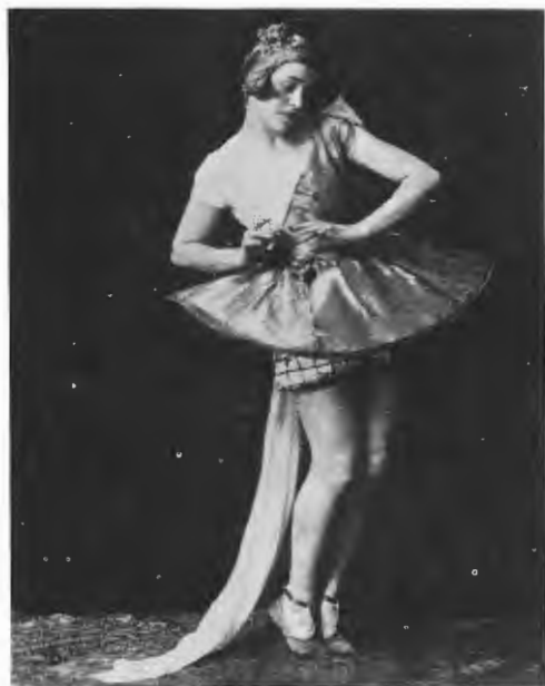
Above: Lotte Lenya as a teenage dancer in Zurich.