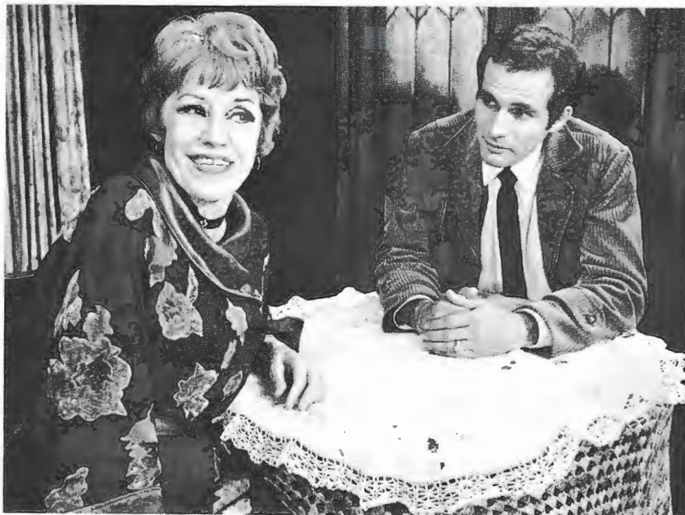
Below: Lotte Lenya (seen here with Larry Kert) as the Berlin Landlady, Fraulein Schneider in the Broadway hit musical, "Cabaret."

producer, and fervently appreciated by all who saw it."