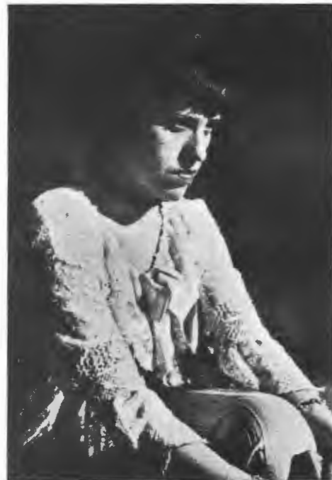
Above: Lotte Lenya as Jenny Diver in the original production of "The Threepenny Opera" in Berlin in 1928.