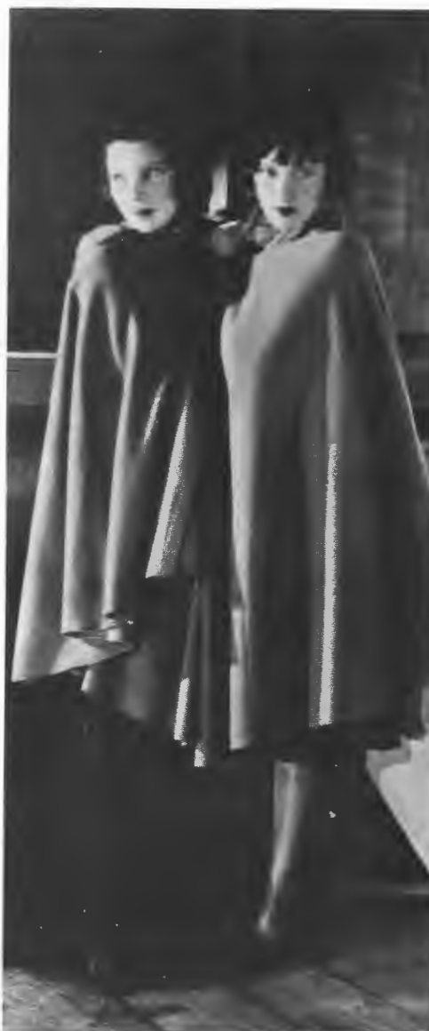
Right: Lotte Lenya and Tilly Losch in the original production of "Seven Deadly Sins" in Paris in 1933. Kurt Weill wrote the music, Brecht provided the text, and George Balanchine was the choreographer.