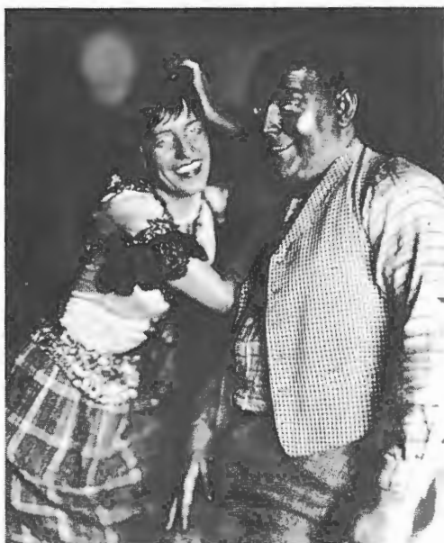
Top: Peter Lorre and Lotte Lenya in a production of Frank Wedekind's "The Awakening of Spring" in Berlin in 1929.